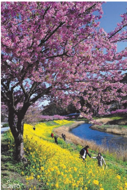
People enjoying late-blooming cherries and swathes of rape flowers along a river bank in Shizuoka. Rape (canola) is normally associated with the countryside, but the combination of cherry and rape flowers can even be found in central Tokyo as shown here not far from the national parliament building, the Diet.

JNTO's cherry blossom page: www.jnto.go.jp/sakura/eng/index.php